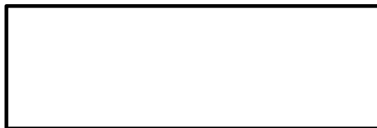
Figure 1: Name of Picture

Source: Author’s Last name OR Organization’s name (Year, Page number OR Online) Khoman (2017, p. 137)