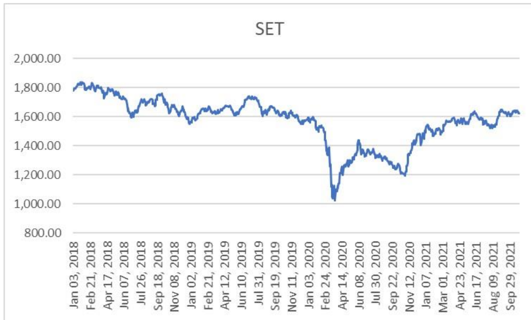
Figure A1: SET Index Daily Closing Price January 2018 – October 2021