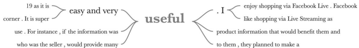
Figure 4: Word Tree (Useful)

Based on the feedback from the interviewees and as indicated in Figure 3, ease of use emerges as a prominent factor influencing the decision to make online purchases through Facebook Live streaming. All participants shared a common perception that Facebook Live streaming is remarkably user-friendly and straightforward, which significantly adds to its attractiveness as a platform for online shopping.