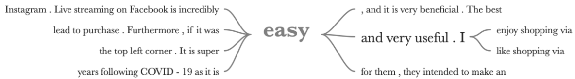
Figure 3: Word Tree (Easy)

Based on the feedback from the interviewees and as indicated in Figure 3, ease of use emerges as a prominent factor influencing the decision to make online purchases through Facebook Live streaming. All participants shared a common perception that Facebook Live streaming is remarkably user-friendly and straightforward, which significantly adds to its attractiveness as a platform for online shopping.