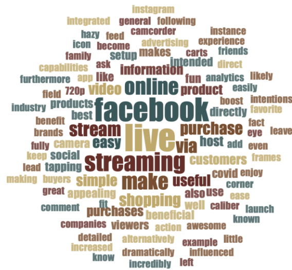
Figure 1: Word Cloud