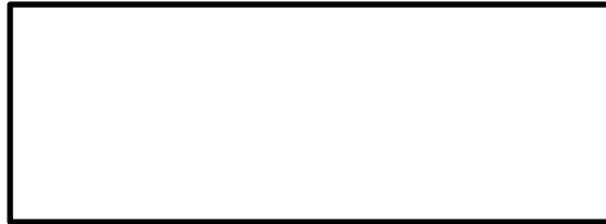
Figure 1: Name of Picture

Source: Author’s Last name OR Organization’s name (Year, Page number OR Online) Khomani (2017, p. 137)